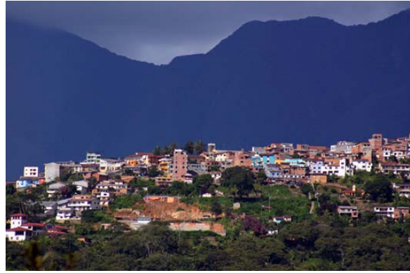
[Coroico, Provincia Nor Yungas, La Paz]